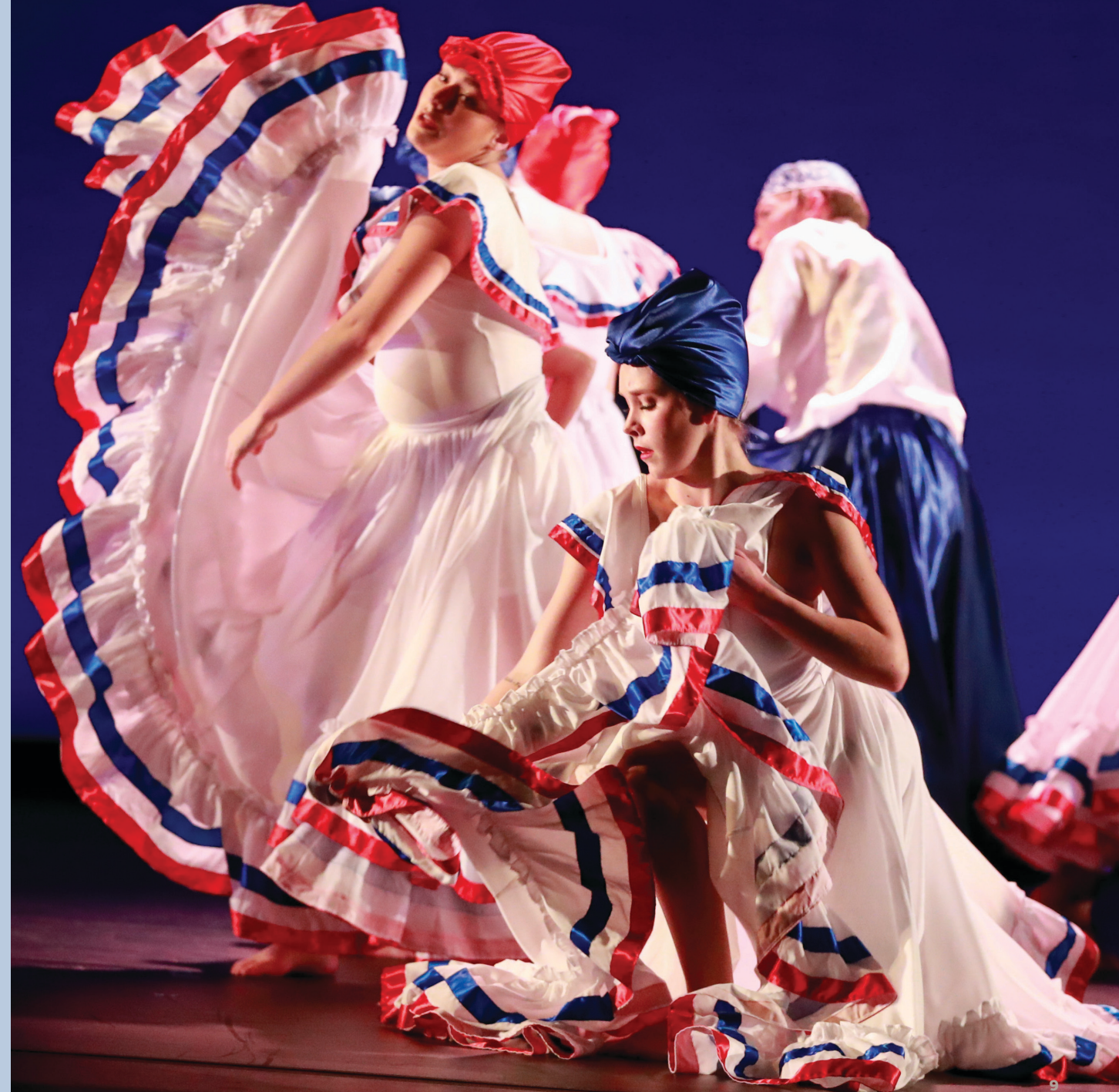
Crossroads in Conversation (2021) by Beatrice Capote

OnStage, an international leader in theatre opinion and discussion, ranks the B.F.A. in Dance within the top thirty in the United States for 2019–2020.