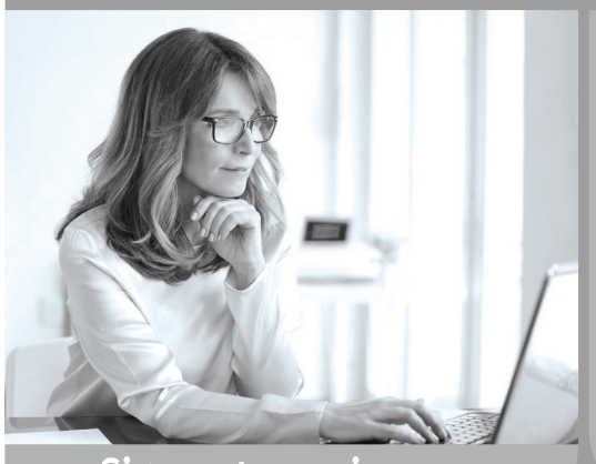
Sign up to receive our weekly e-newsletter!